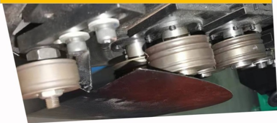
Technical parameters of servo circle machine

送线轮 光洁，耐磨，多线槽，精加工 wire feeding wheel is smooth, wear-resistant, multi trunking and finish machining