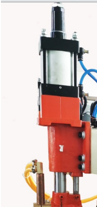
Comparison of medium frequency and power frequency welding effects

Weld nuts with an intermediate frequency welder