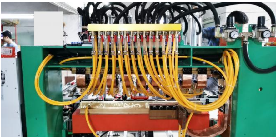
Principle of spot welding

4.The transparent water flow valve is customized in Taiwan. There are nearly 100 cylinder + solenoid valve actions of gantry welder, and dozens of water circulation. With this gadget, no matter which route has a problem, it is easy to find and see it safely,