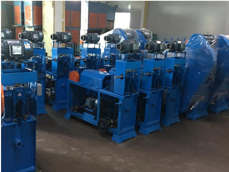
Display after straightening the iron wire